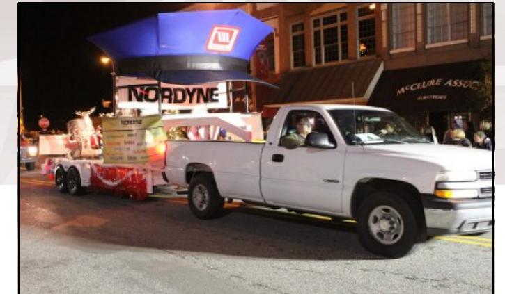
Nordyne's float in the 62nd Annual Dyersburg Christmas Parade