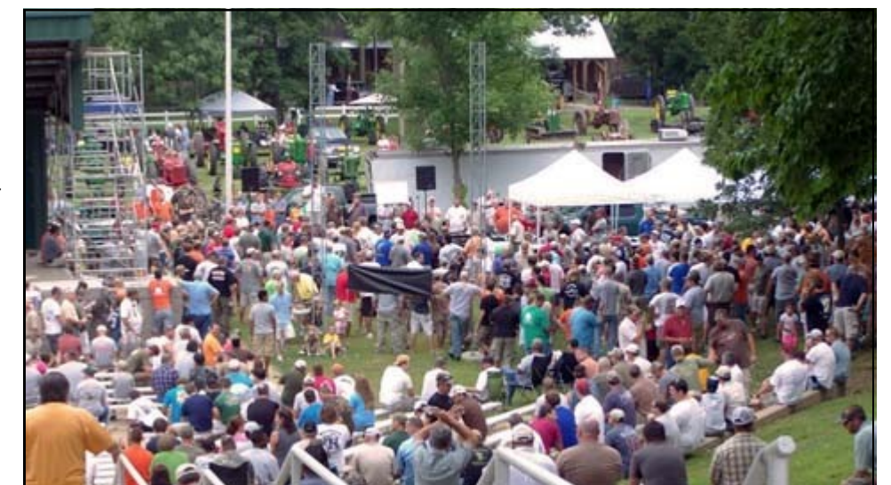
The 2nd Annual Dyersburg Duckfest was held at the Dyer County Fairgrounds.

We assisted with the "The Way We Worked" exhibit at the Dyer County Museum.