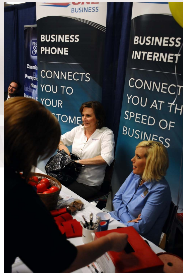
CableONE's booth at the 2011 Chamber Business Expo held in April

We completed a drawdown of approximately $25,000 of USDA Rural Development Grant funding for repairs to the Market Building.