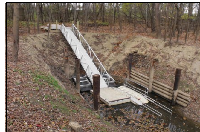
Mississippi River Corridor-TN completes construction on the River Park's floating dock