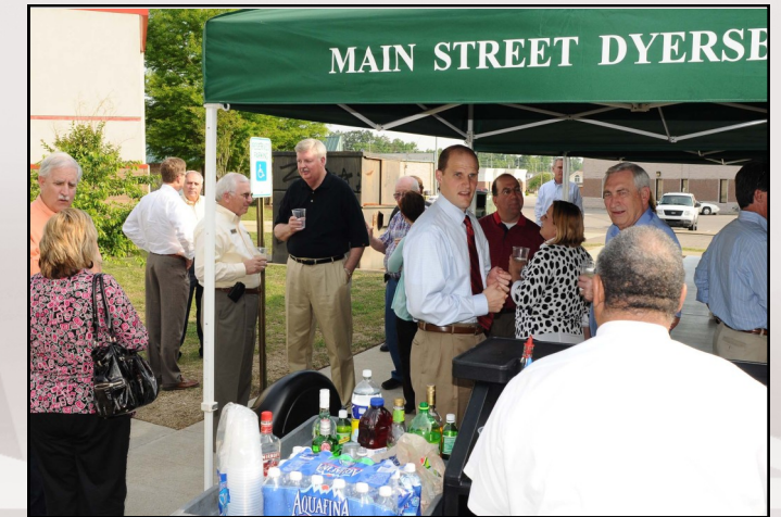
The 2011 Industry Appreciation Picnic was held in May.

Ads placed this year in the following publications: Site Selection, Area Development, Business Facilities,