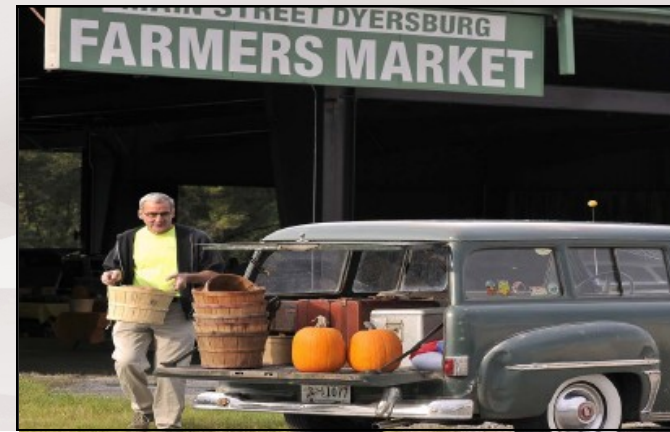
Main Street Farmers Market